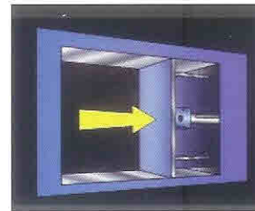
Combo Door™ open (normal bale ejection)