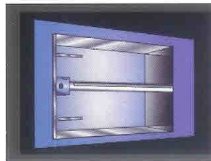
Combo Door™ closed (fully extended for bale separation)

The Harris unique patented Combo Door™ option combines the bale separation and bale release in one door. When fully extended, the Combo Door™ is closed for clean bale separation. This separation feature ensures high bale weights, densities, uniform bale lengths, and easy grade changeovers. For normal bale release, the door opens to its "home" position. During oversize bale operation it enlarges the bale door opening by an additional 7 in. (178mm) for the easy ejection of oversize bales. This simple, yet innovative mechanism, significantly reduces bale jamming.