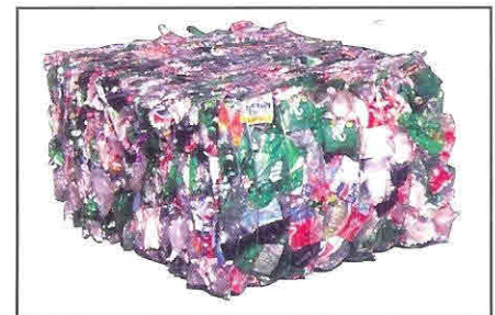
Plastic Bale (PET)