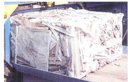
Non-Ferrous Metal Bale