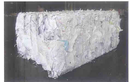
High Grade Paper Bale