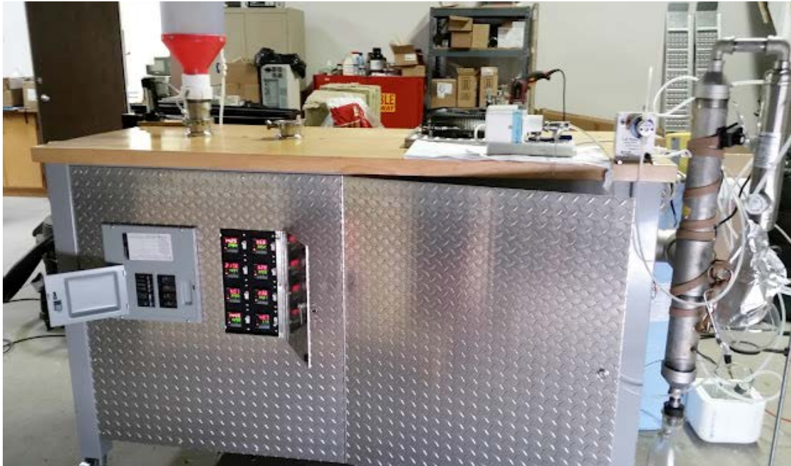
PTF200 with mini-fractionator attached