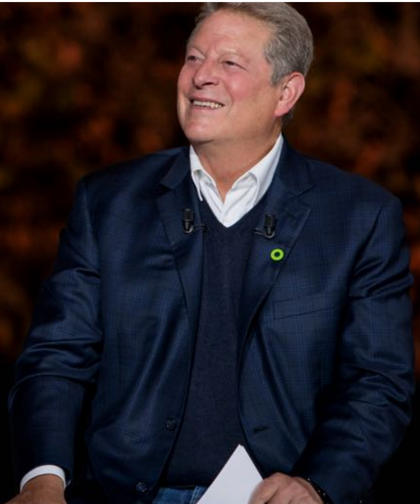
Former Vice President Al Gore