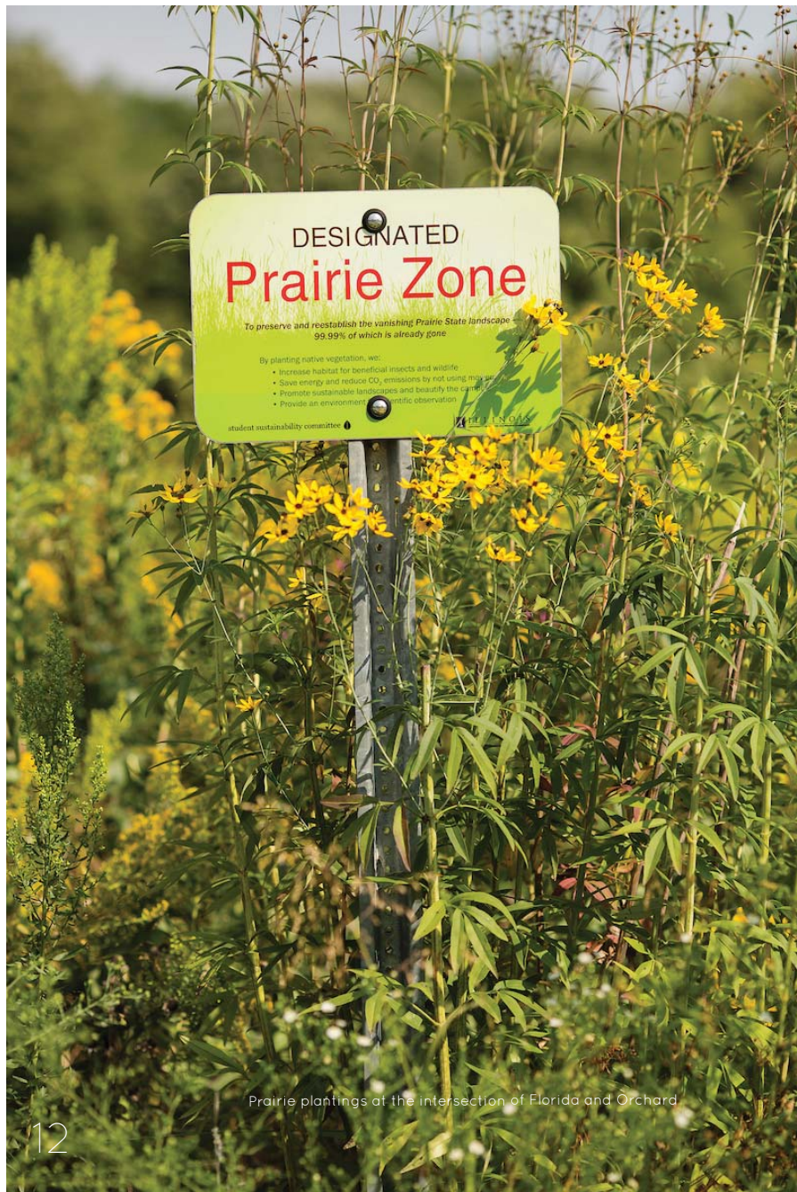
Prairie plantings at the intersection of Florida and Orchard

The Lincoln Avenue Residence Hall Living and Learning Community (LLC) is aware of the interest in increasing the number of campus locations with native plants. They would like to join the effort to plant Native Plant Species in selected areas around Campus. The goal of this project is to locate plants in places like the unused space between Allen Hall and Lincoln Ave. Residence. There are several other locations around these residences that are suitable for planting near the buildings and in areas where mowing is difficult because of corners and the placing of equipment like large compressors. By selecting a variety of plants that bloom over the growing season, this project provides habitat and food resources for a wide range of butterflies, bees, and other pollinators as well as birds.