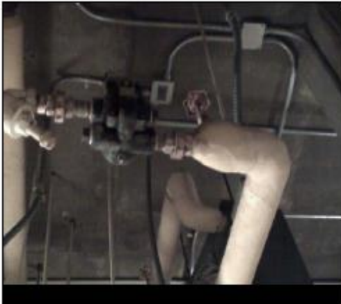
Existing Steam Trap

Repairing steam traps and broken control valves is one of the most cost effective things that we can do. The Vet Med ESCO project with guaranteed savings projected a payback of 1.5 years on this type of work at that location.