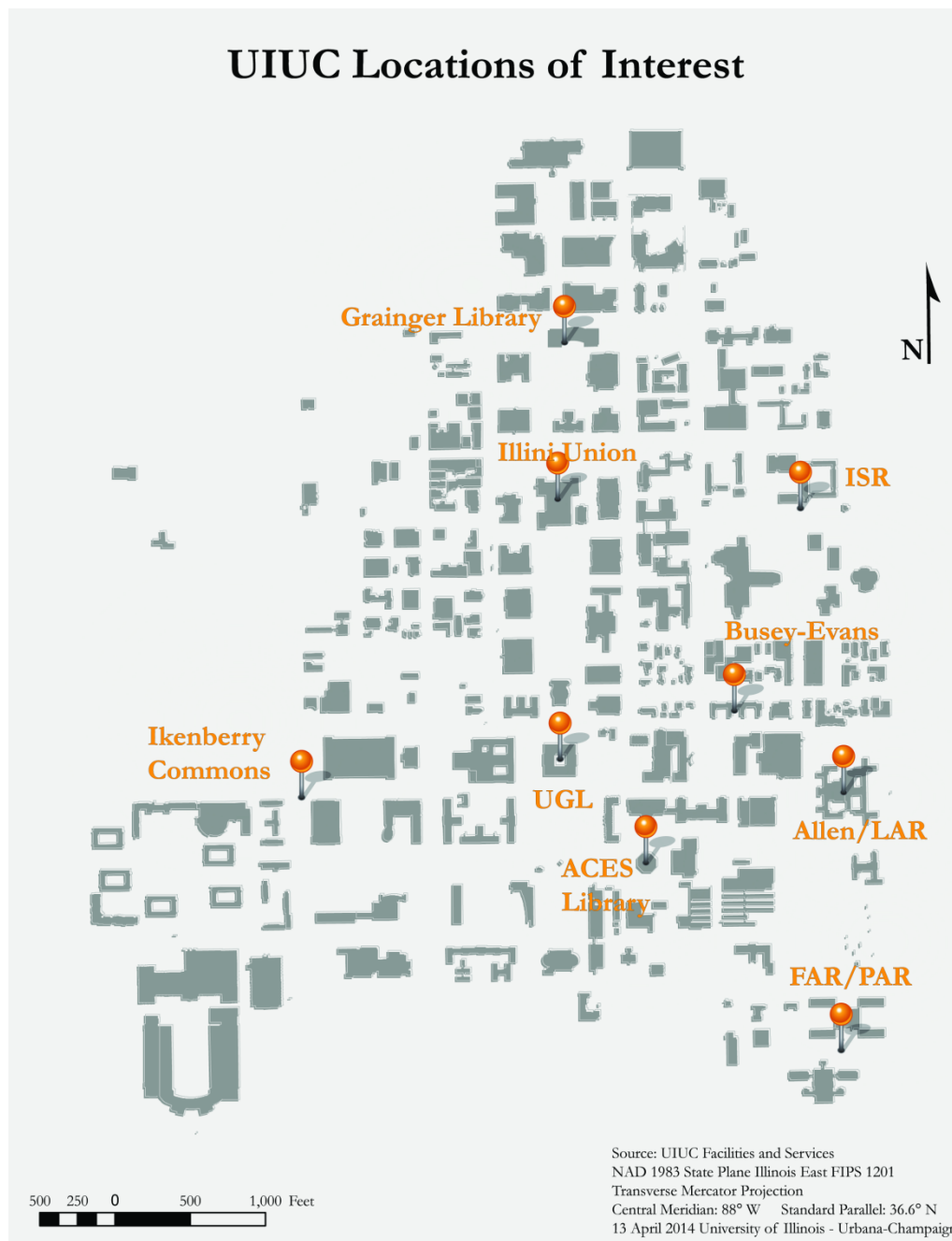
FIGURE 1: UIUC LOCATIONS OF INTEREST

I organized my data into a geodatabase using three feature datasets: one for existing pathways, one for planned pathways, and one for streets. Into each of these I placed the respective clipped line feature class. I found the GIS data to be very “dirty” for my needs. A particular problem was that many line features which appeared to be single seamless paths actually consisted of several