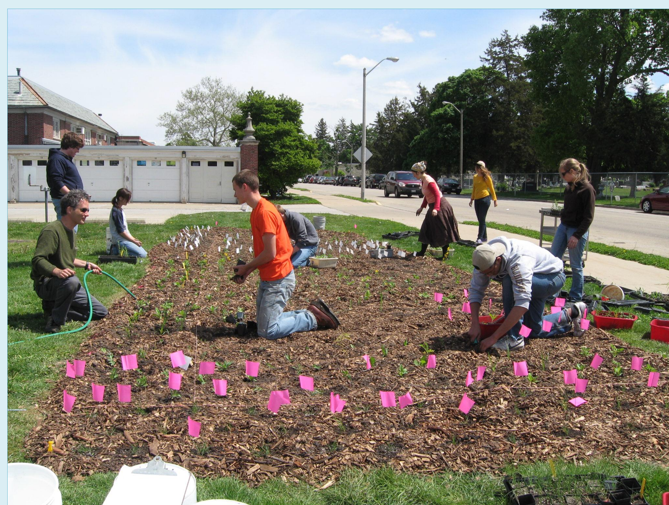
On April 22, 2012, student and staff volunteers planted seedlings of 18 prairie species in the patch.