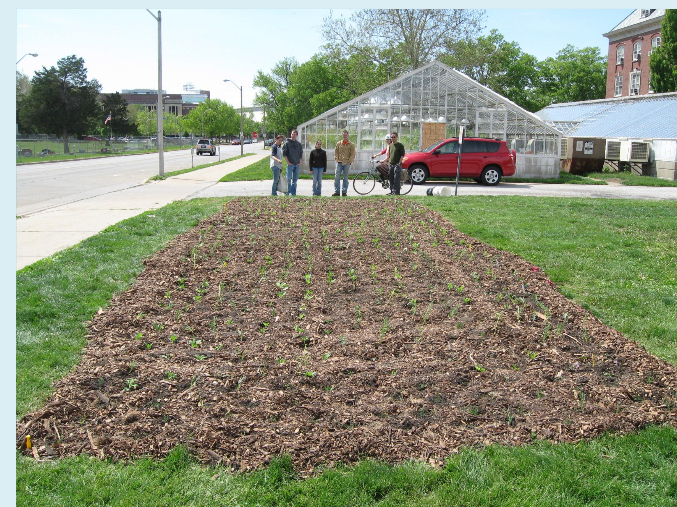
Tiny seedlings in a sea of mulch were watered and weeded over the summer while they matured to blooming size.