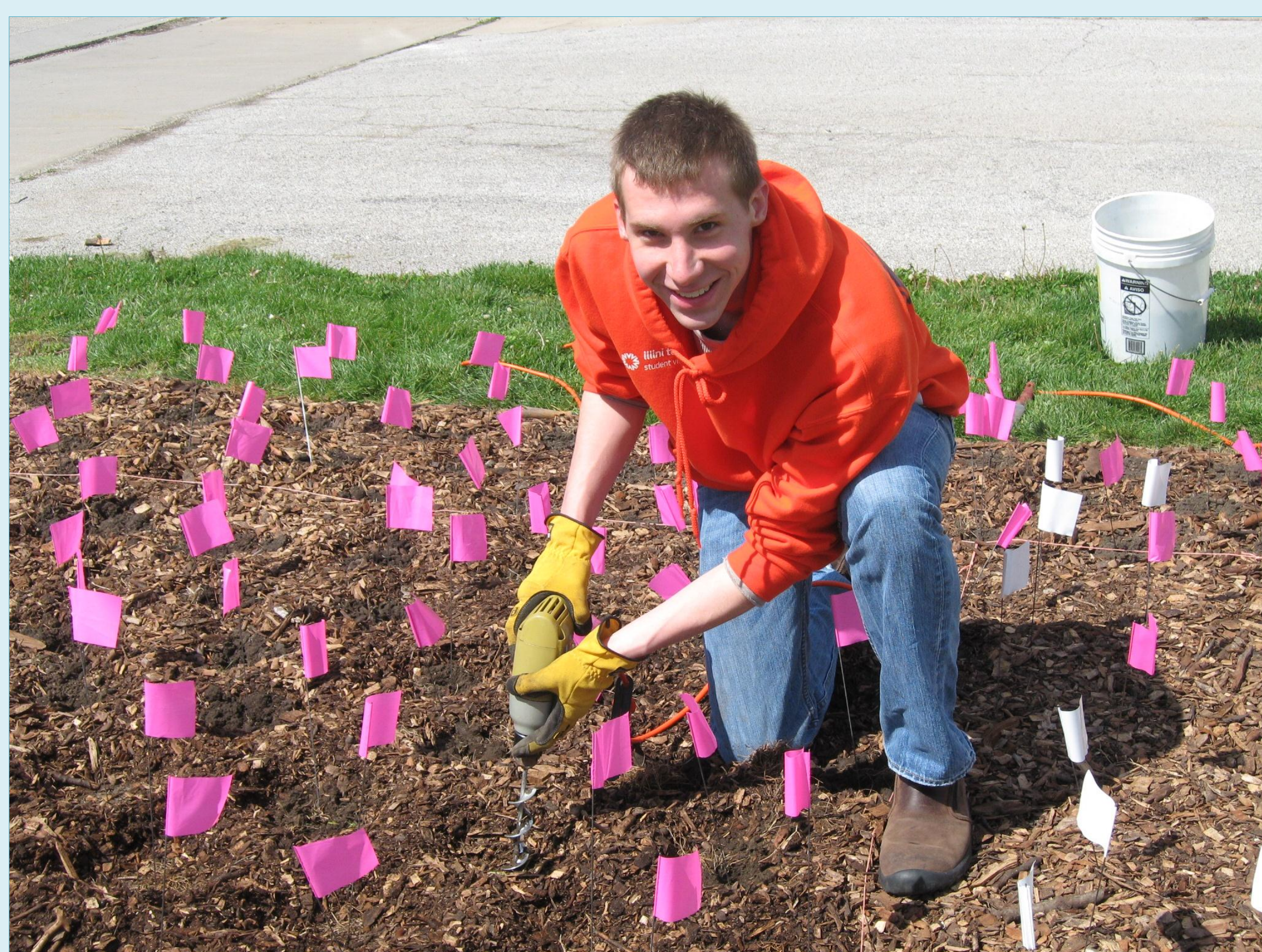
Facilities and Services prepared and mulched the plot. Students then used drills to prepare holes for the seedlings.