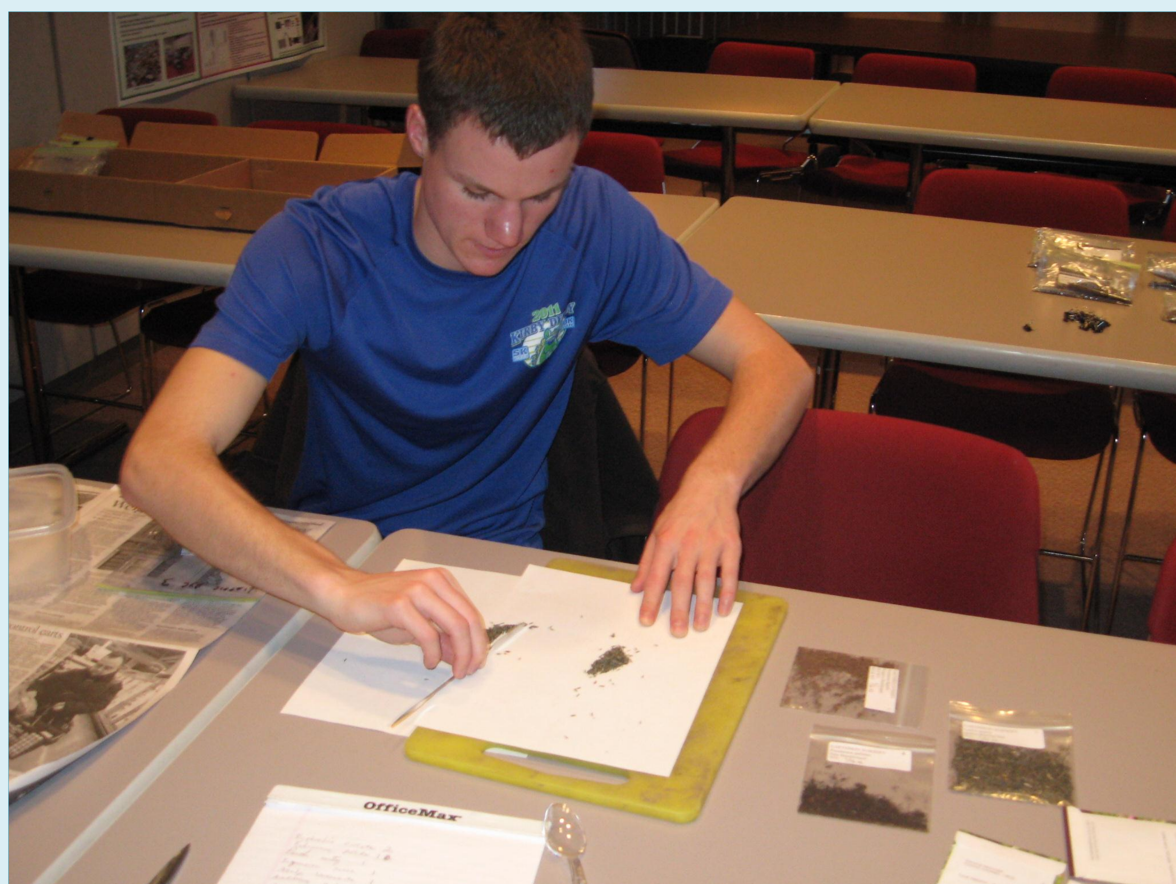
During December 2011, seeds were stratified by placing them in a refrigerator. This process is necessary for many species to germinate.

The Student Sustainability Committee at the University of Illinois provided a grant to the Prairie Research Institute to develop a native prairie patch behind the Natural Resources Building (NRB) and grow plants for other locations. Over 100 volunteers from campus and the community at large, ranging in age from 4 to over 70, participated. The patch went from seed to full bloom in a single season. The patch attracted hundreds of butterflies, bees, birds and other species that depend on native plants for food for themselves and their young.