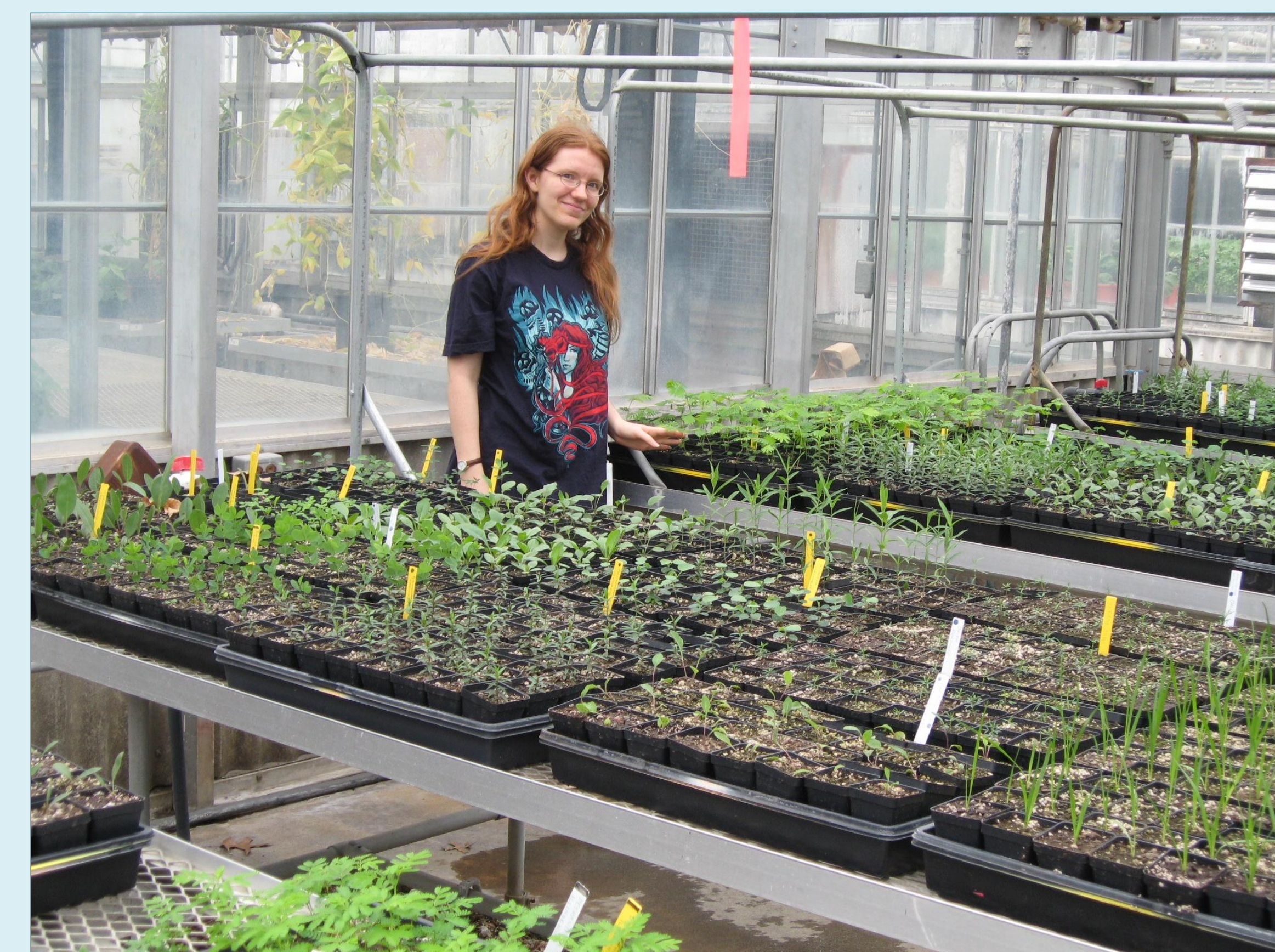
Six to eight weeks after planting, the seedlings were transplanted to small pots to continue growing under less crowded conditions.